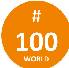
INTERNATIONAL MBA FEBRUARY 2025