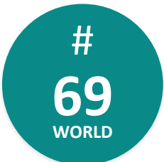
INTERNATIONAL MBA SEPTEMBER 2025