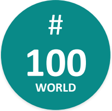
GLOBAL MBA FEBRUARY 2024