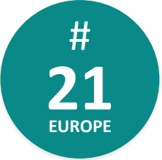
GLOBAL MASTERS IN MANAGEMENT SEPTEMBER 2024