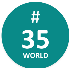
MASTERS IN FINANCE PRE-EXPERIENCE 2025