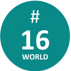
OPEN & CUSTOM PROGRAMMES EXECUTIVE EDUCATION MAY 2024