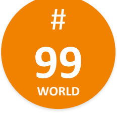
EXECUTIVE MBA OCTOBER 2024